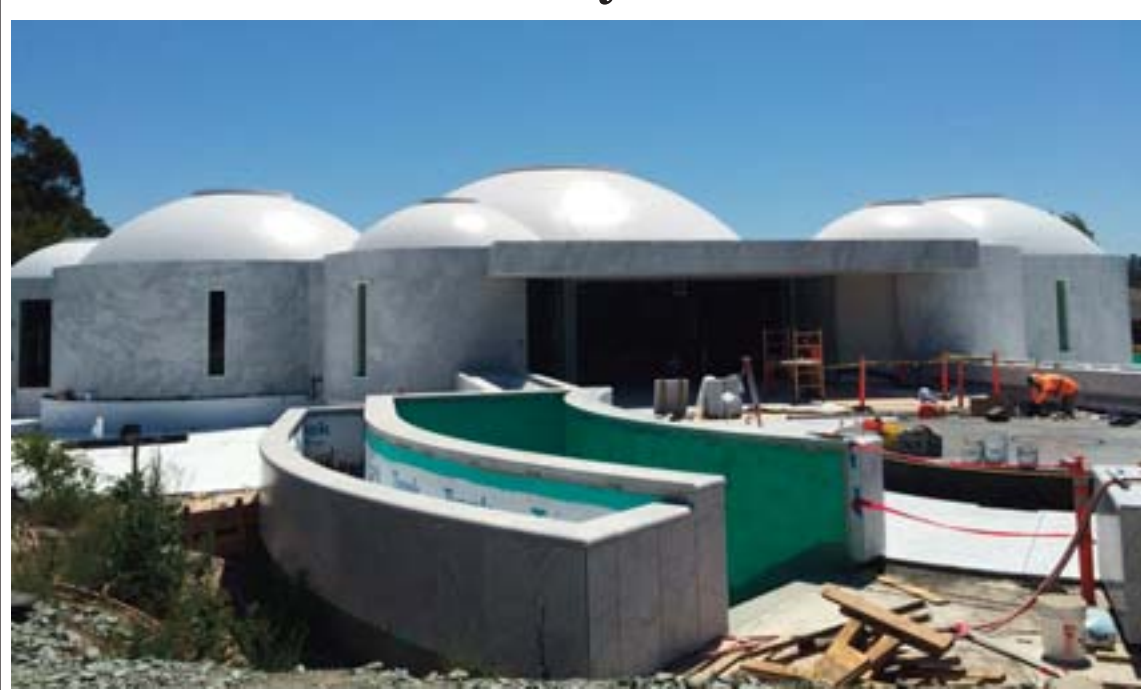
Sufism Reoriented Sanctuary construction site

"On the one hand I was surprised at the volatility of the negativity and how it was focused," Carpenter said. "On the other hand, often times really important projects in the world require a certain amount of opposition because it creates a kind of pool of energy that we were therefore able to rise to."